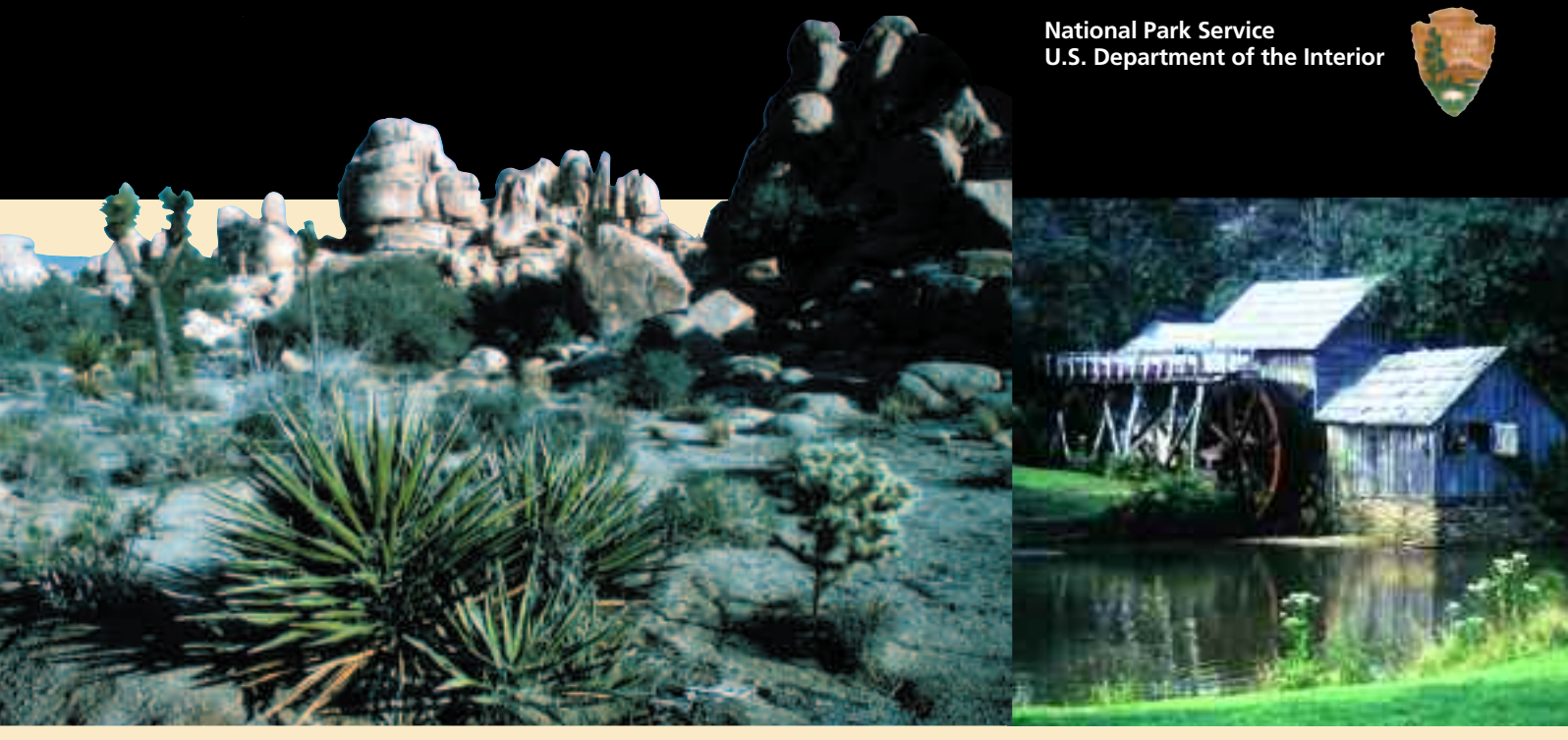
Joshua Tree National Monument