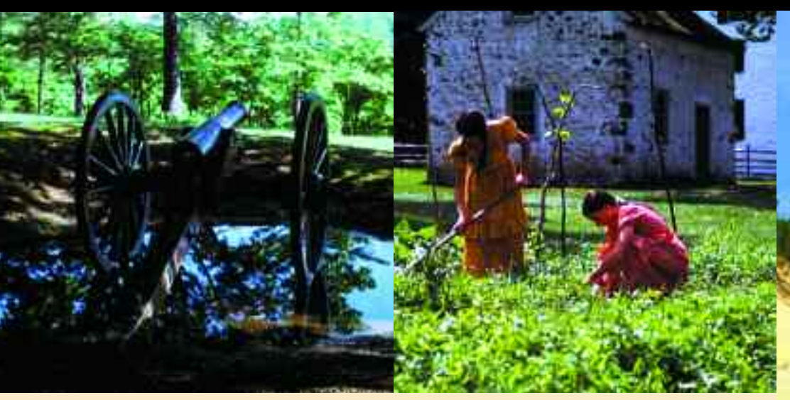
Fredericksburg and Spotsylvania County Battlefields Hopewell Furnace National Historic Site Memorial National Military Park