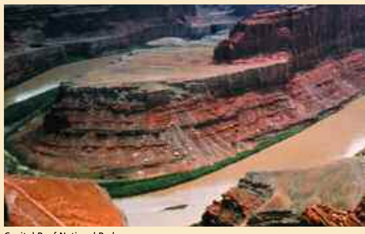
Capitol Reef National Park